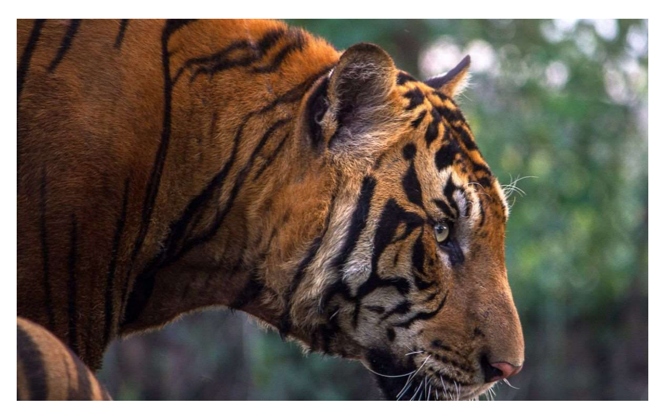
DAY 6 "Roam Ranthambore in Search of Tigers" Thursday, December 7, 2023 Ranthambore National Park - Rajasthan - India

Start the day with an early morning visit to Ranthambore National Park, which was once the hunting ground of the Maharaja of Jaipur. Before the heat of the day sets in and the wilderness awakens, keep a keen eye out for the resident animal and birdlife that find sanctuary here. You'll also want to have your camera ready in case the park's tigers make a brief appearance. Return to your hotel for a late breakfast, followed by some time to relax or consider joining an Optional Experience. After lunch, there's another opportunity to explore the park for glimpses of the various species of bird and wildlife on your second game drive of the day. Dinner is served this evening at your hotel.