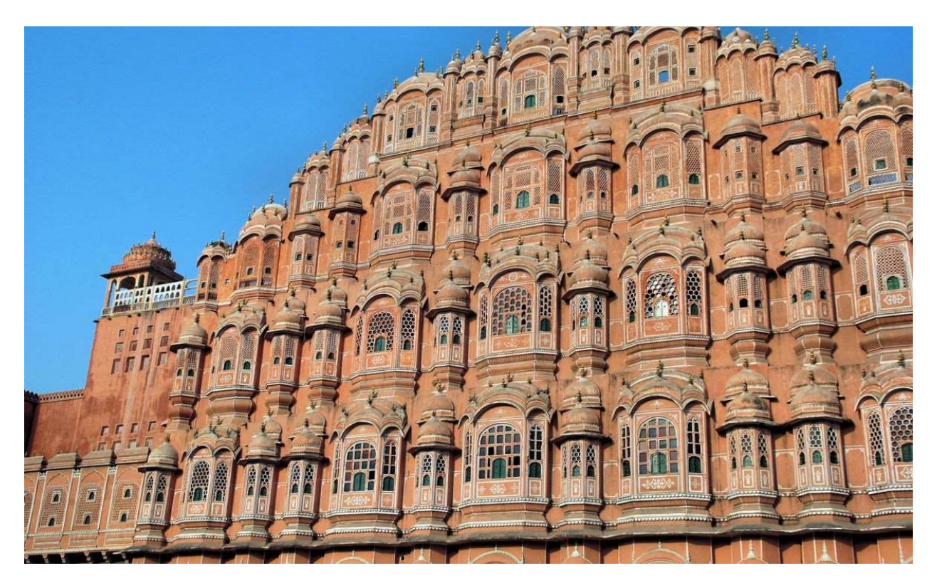
DAY 7 "Onwards to Jaipur" December 8, 2023 Jaipur - India

Continue your journey to Jaipur, the Pink City. After some free time for lunch, join a workshop on hand-block printing, one of the most famous traditional art forms of Rajasthan. A skilled Local Specialist will show you the tricks of the trade as you observe how the prints are handmade using small wooden blocks and hone your own block-printing skills. Later, Dive Into Culture and see the talents of local craftspeople on display during a visit to a local market. Admire the colourful textiles and perhaps buy a memento or two to take home. Jaipur is particularly renowned for its embroidery and blue pottery. This evening, join a local family for an exclusive Be My Guest dinner in their home. Connect With Locals and savour some of the regional delicacies.