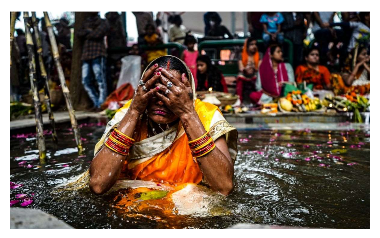
DAY 9 "Venture to Varanasi" Sunday, December 10, 2023 Varanasi - India

Depart Jaipur this morning and board your included flight to embark on a pilgrimage to the sacred city of Varanasi, exploring the city's role as the centre of Hindu religion. There's a palpable sense that life begins and ends on the shores of Ganga Mata (Mother Ganges). Spirituality extends beyond the sacred waters of this mighty river, however. The city is also renowned for its ancient temples mostly dedicated to Lord Shiva, and its old ghats, which lead down to the river. You'll see all this and more, but first there's some free time for lunch before the sightseeing begins. Next Dive into Culture and experience a rural way of life during a walk around Weavers Village, where a Local Specialist will reveal the centuries-old silk weaving tradition. Your visit during this MAKE TRAVEL MATTER® Experience will help the community's efforts to keep this extraordinary tradition alive. You'll also see first-hand how the talented weavers create beautiful silk fabrics. These are used to make the famous Banarasi silk saris, which are sought after for weddings and other special occasions. Later this evening, feed your soul as you cruise down the River Ganges to witness the ritual of Aarti. Watch as the delicate diya laden with a candle and tiny blooms floats in a magical train down the river. After this poignant ritual, you'll return to your hotel and enjoy dinner.