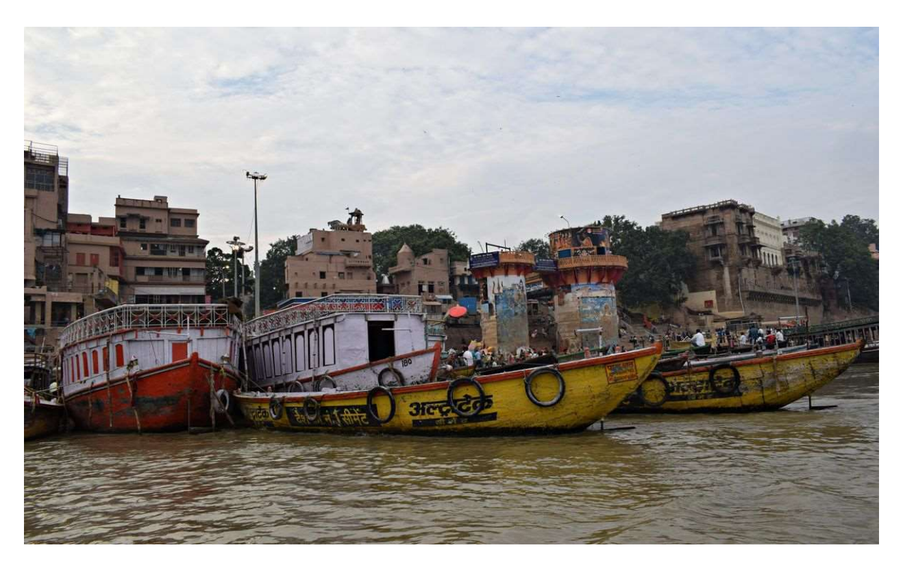
DAY 11 "Farewell Varanasi" Tuesday, December 12, 2023 Varanasi - India

Your spiritual and cultural encounter with India at its end, it's time to bid a sad farewell to Varanasi. Take a transfer to the airport for your onward flight.