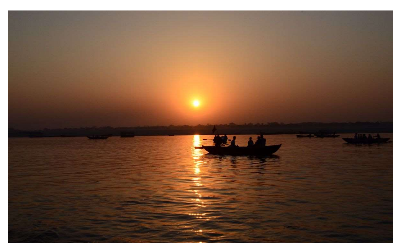
DAY 10 "Witness Local Life Along the Ganges" Monday, December 11, 2023 Varanasi - India

Admire the pink light of sunrise appear over the Ganges, watching the sights and sounds of Varanasi stir slowly along the banks of the river. Observe the locals taking their morning bath in the holy water while worshipping the rising sun. Afterwards, explore the city on foot, the best way to immerse yourself in the day-to-day of the oldest living city of the world. You'll have an opportunity to visit Kashi Vishwanath Temple, one of the most famous Shiva temples. Demolished and rebuilt many times over its history, this is Varanasi's main temple, and it's a sight to behold with its towering spire and domes made of pure gold. You'll return to your hotel for breakfast and some free time. Perhaps choose to join our Optional Experience to watch a live performance of Indian classical dances known as Kathak. This afternoon, visit Sarnath, one of the four holy Buddhist sites sanctioned by the Buddha himself for pilgrimage. Explore the spectacular collection of Buddhist artefacts dating back to the 3 BC and see the Lion Capital of Ashoka with its inverted lotus carving, adopted as the national emblem of India. Then, return to your hotel for an evening at leisure.