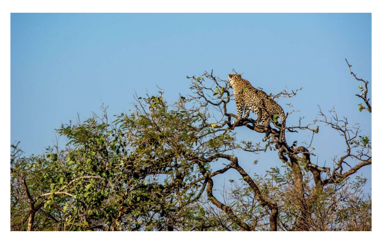
DAY 3 "SEE THE SIGHTS OF DELHI" Monday, December 4, 2023 New Delhi - India

Dive Into Culture this morning and join a guided walking tour run by one of the rehabilitated street children who were taken in by the Salaam Baalak Trust in Delhi. Your visit is a MAKE TRAVEL MATTER® Experience and supports this non-profit organization and the street children for whom it cares. Later, walk through Paharganj Bazaar, rubbing shoulders with the locals who flock to the market to shop every day. Escape the noise and head to New Delhi, designed and built by the British in the 1920s. Your first stop here is a visit to the UNESCO-listed Humayun's Tomb, the earliest example of Mughal architecture in India. Recently renovated with the gardens restored to their former glory, you'll see first-hand why it served as the inspiration for the design of the famous Taj Mahal. Enjoy local flavors for lunch at a restaurant near India Gate, then head to the Qutub Minar complex, also a UNESCO listed site. This fluted 'Victory Tower' is decorated with elaborate inscriptions, geometric carvings and elegant balconies. Returning your hotel later, you'll drive past Lutyens' Delhi to view the elegant colonial façades leading British architect Edwin Lutyens left behind on the cityscape.