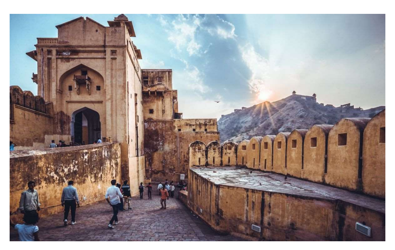
DAY 8 "Explore Colorful Jaipur" Saturday, December 9, 2023 Jaipur - India

One of today's highlights is a visit to the UNESCO-listed Amber Fort. But first, stop to admire the red and pink façades of the Palace of Winds, whose latticed windows once revealed the outside world to the sheltered ladies of the royal household. Continue with a visit to the ornate City Palace, an impressive complex of buildings from different eras and gardens in the heart of the Old City. You'll have some free time for lunch before visiting the UNESCO-listed Jantar Mantar Observatory, featuring the world's largest sundial. Later, you could choose to join our optional Aarti ceremony, offering a blessing to one of the Hindu deities and hopefully receiving one in return. This evening, we'll toast to shared memories over a delicious local dinner and say farewell to those not travelling on to Varanasi.