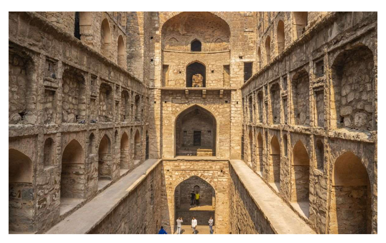
DAY 2 "DISCOVER THE DELIGHTS OF OLD DELHI" Sunday, December 3, 2023 New Delhi - India

Savor the scents of spice as you embark on an exhilarating rickshaw ride, navigating the busy streets of Old Delhi. See the Red Fort, a sandstone fortress which once housed the emperors of the Mughal dynasty for centuries. Next, Dive Into Culture as you ride through the colorful Chandni Chowk market and watch it come to life as the day's trading begins amidst the sounds of enthusiastic salesmen and endless traffic. Visit Jama Masjid, one of the largest mosques in India. Admire its ornate façades before boarding a waiting vehicle to drive to Raj Ghat, a memorial dedicated to Mahatma Gandhi. Pay tribute to this beloved figurehead, who led the campaign for India's independence from Britain. You'll come face-to-face with the site where he was cremated following his assassination in 1948. Today the simple square platform of black marble is surrounded by a tranquil park, befitting of its status as a place of contemplation. Your next stop is Agrasen Ki Baoli, one of the most noteworthy stepwells in Delhi. Hidden amidst the cacophony of Delhi's streets and business towers, this ancient water reservoir rises from the depths of the earth to stand atop 103 stone steps.